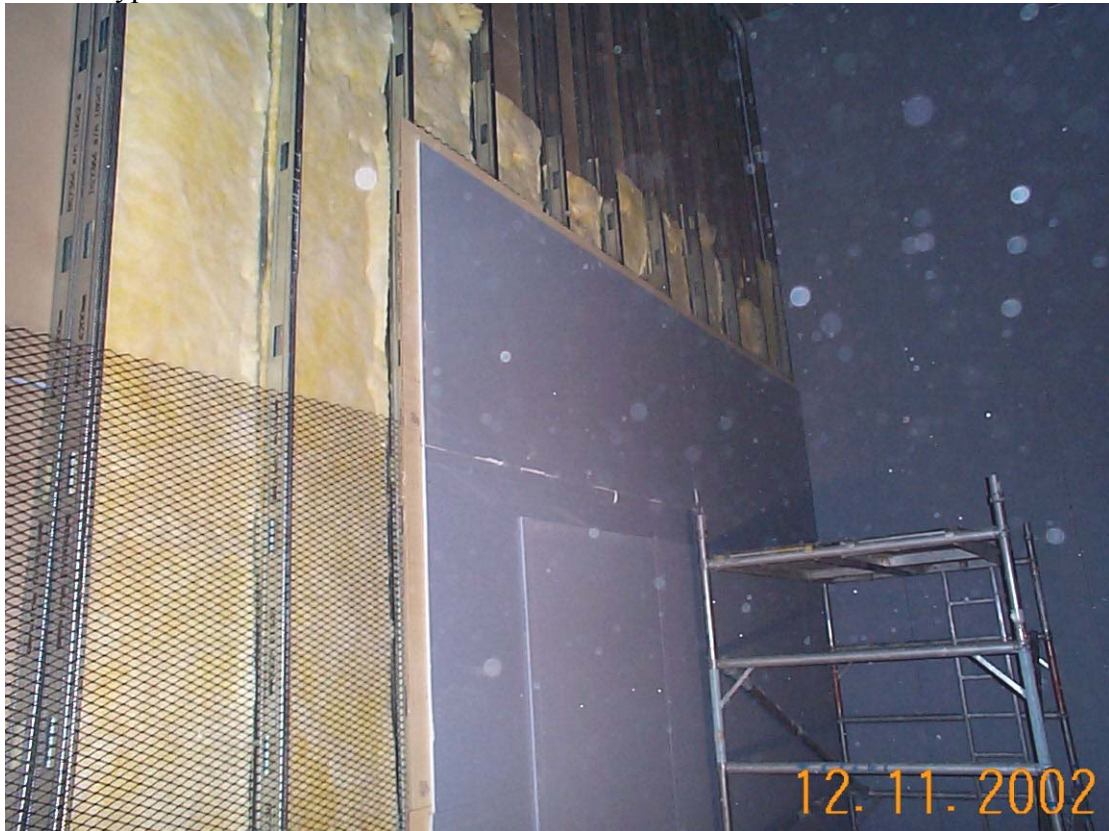
Figures above & below show the Audio wall detail, Isowool acoustic insulation, Expamet security lath, WPB plywood and two layers of BG soundbloc. A fire rated deflection head was also installed as per specification.